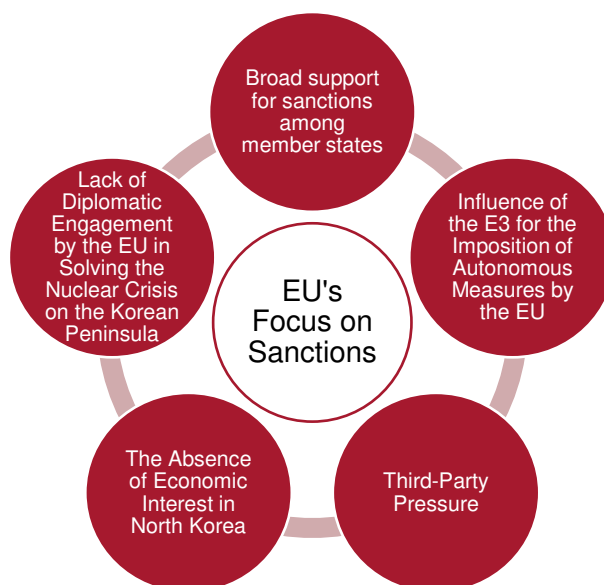
Figure 1. Explanatory factors of the EU's focus on sanctions against North Korea

restrictive measures as well as the suspension of official dialogue tracks. In 2015 the EU furthermore suspended its official dialogue with North Korea, leaving by and large some informal dialogue channels, the diplomatic representations of EU member states in Pyongyang as well as a few engagement initiatives by individual EU member states. The EU's passive stance and focus on sanctions is explained by a number of interdependent explanatory factors that are summarised in Figure 1. 5