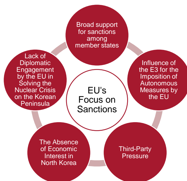
Figure 1. Explanatory factors of the EU's focus on sanctions against North Korea

restrictive measures as well as the suspension of official dialogue tracks. In 2015 the EU furthermore suspended its official dialogue with North Korea, leaving by and large some informal dialogue channels, the diplomatic representations of EU member states in Pyongyang as well as a few engagement initiatives by individual EU member states. The EU's passive stance and focus on sanctions is explained by a number of interdependent explanatory factors that are summarised in Figure 1. 5