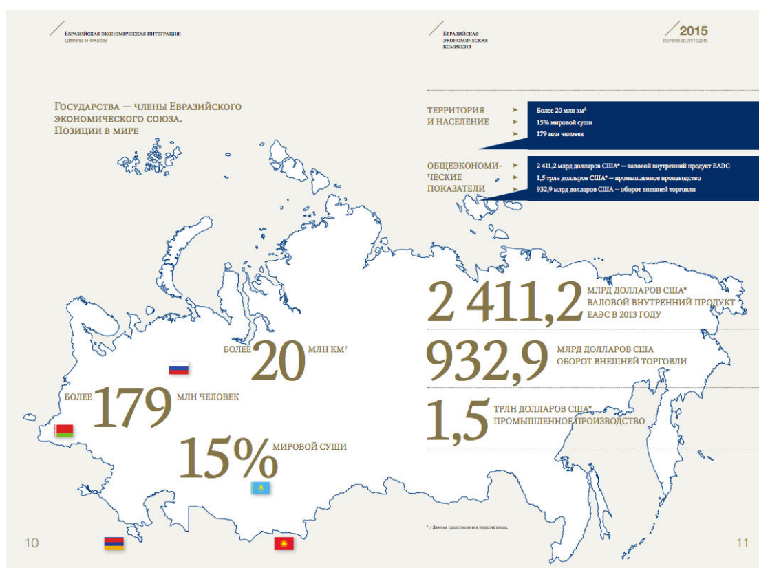
Figure 1. Basic EEU figures (see translation in the main text below) based on data up to June 2014 3

According to official EEU figures, the organisation includes over 179 million people, covers more than 15% of the world's surface (20 million km 2 ) and generates a combined